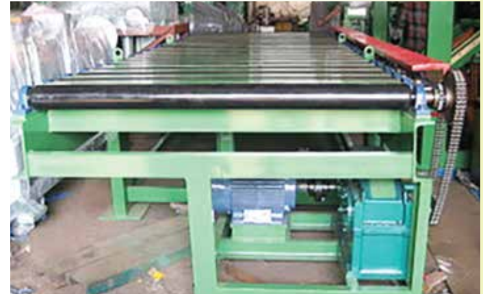
Roller Table Conveyor