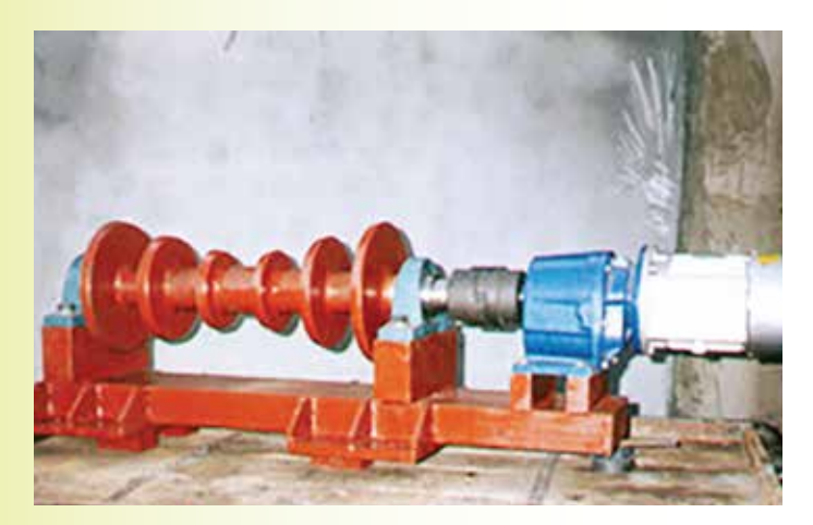
Diabolic Roller Conveyor