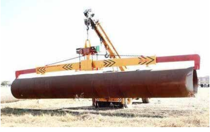
Pipe Lifting Tackle