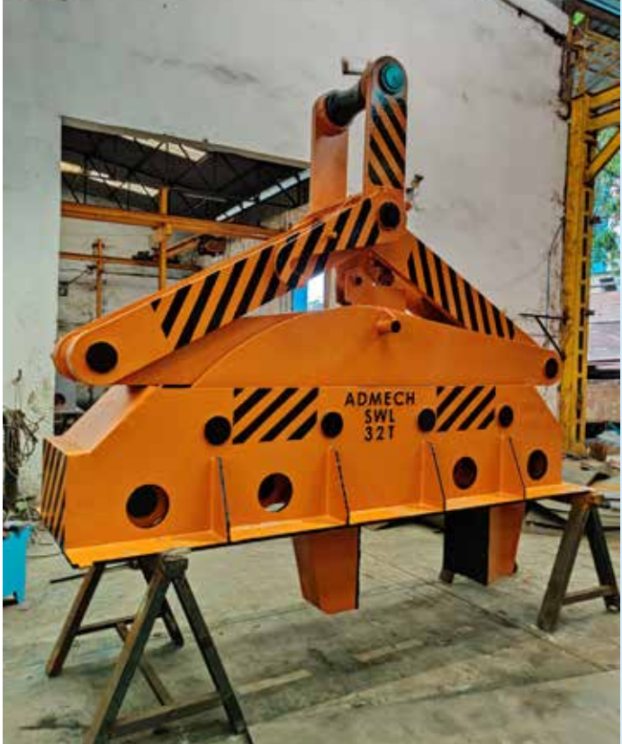
Coil Grab / Coil Tong 32 T