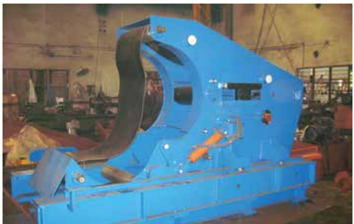
Scrap Bailing Press