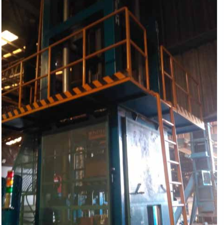
Drop Weight Tear Tester Machine

Features: • Maintenance Free • Fully Automatic • Smooth Operation • Electrical and Mechanical Safety Interlock • High capacity hydraulic shock absorbers • Hydraulic device for specimen placement • Specimen Feed In - Out by Hydraulic / Pneumatic Cylinder.