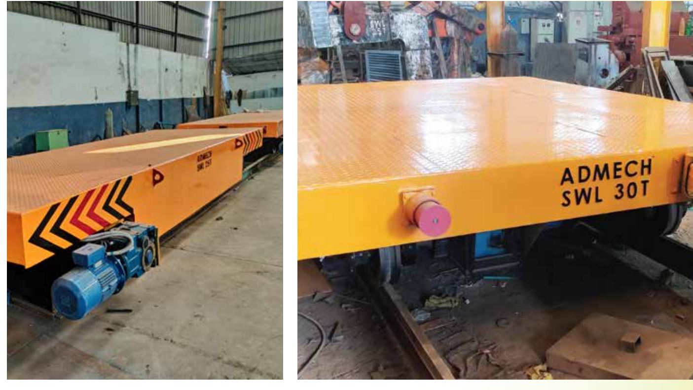
Transfer Trolley 25 T