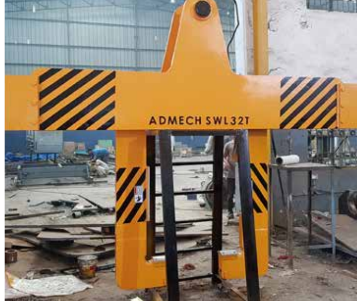
Motorized Dual Arm Coil Lifter 32 T