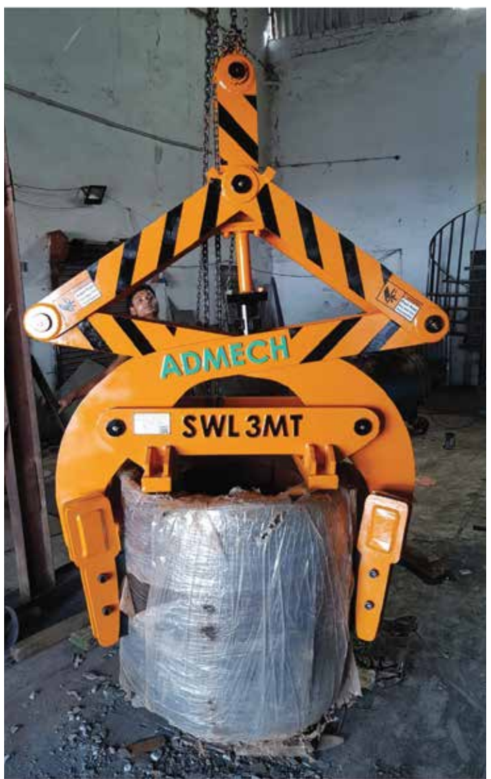
Coil Lifter for Wire Coil 3 T