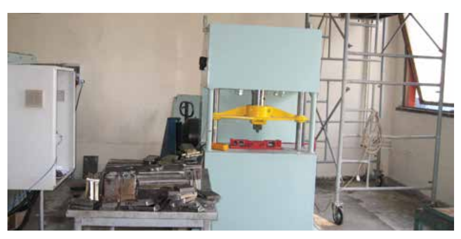
Hydraulic Notching Press