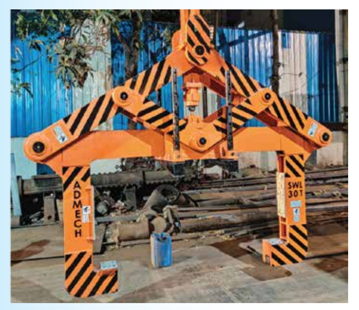
Mechanical Dual Arm Coil Lifter 30 T