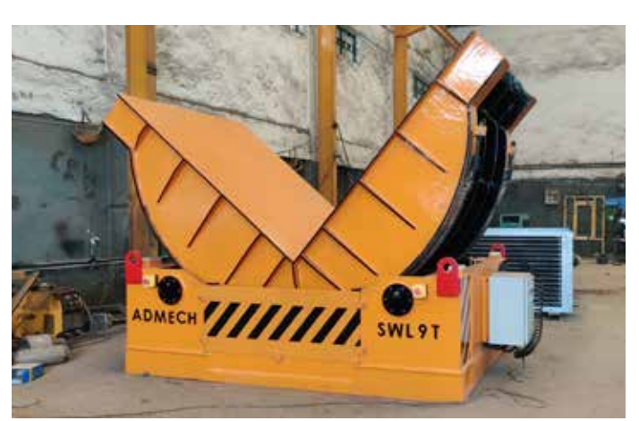
Electro Mechanical Coil Tilter 9 T