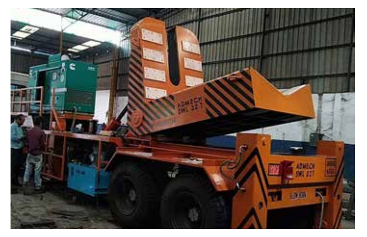
Mobile Hydraulic Coil Tilter 32 T

Features: • Maximum capacity upto 40 MT • Self- supportive designs • Improved and increased safety of operator • Zero defect manufacturing process • No damage to CoiL