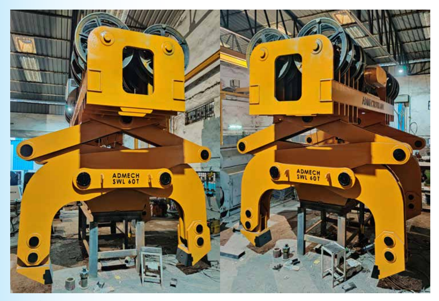
Billets/Ingot Lifting Tong 60 T