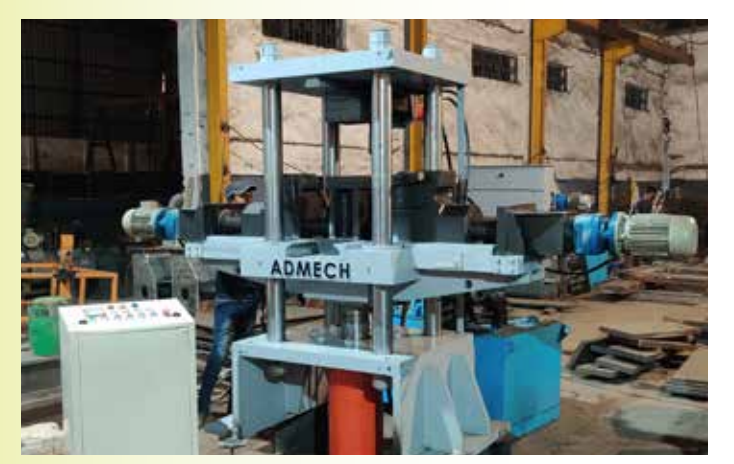
Bending & Folding Machine