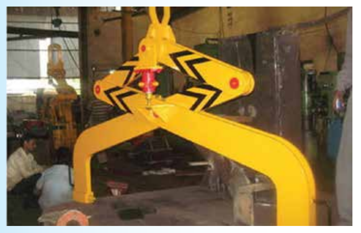
Solid Rod Lifting Tackle