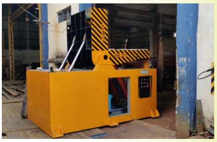
Hydraulic Coil Tilter 22 T