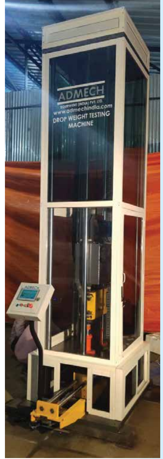
Drop Weight Tester Machine